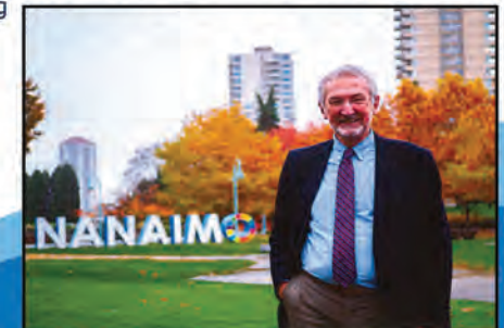
Mayor Leonard Krog

A true equation that makes up our community is simply this: stunning setting + enriching amenities + vibrant economy + welcoming people = an incredible island lifestyle!